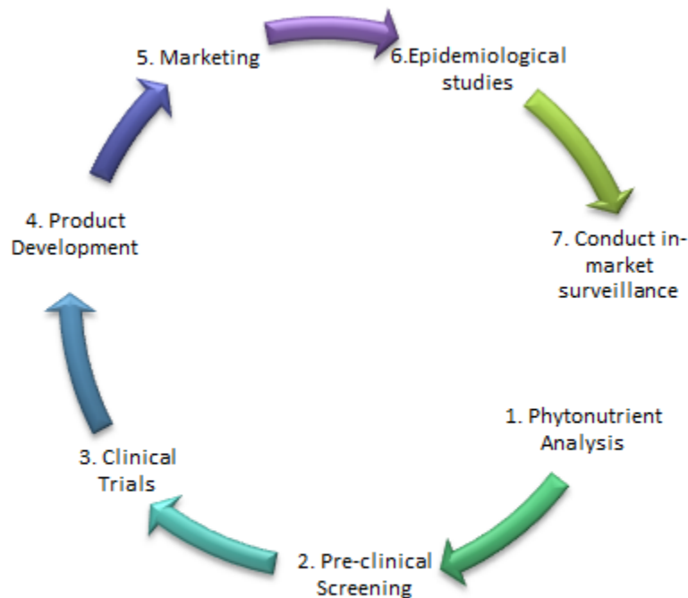
Figure 1.2 Steps for bringing functional foods to markets (FFC)

research. With support from the scientific and governmental communities, bringing functional foods to markets will help billions suffering from chronic illnesses and general health problems. Below (Figure 1.2) is a cycle of steps that the FFC believes will help bring functional foods to market [47].